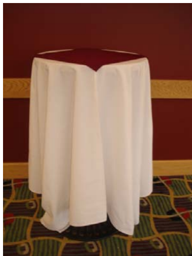
Covered with Table Cloth